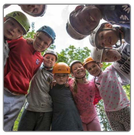
We can't wait to see you at Robinwood!