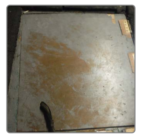
If I want to get out of the caves there are exit hatches in the roof. If I knock on it, my Group Leader will come and let me out.