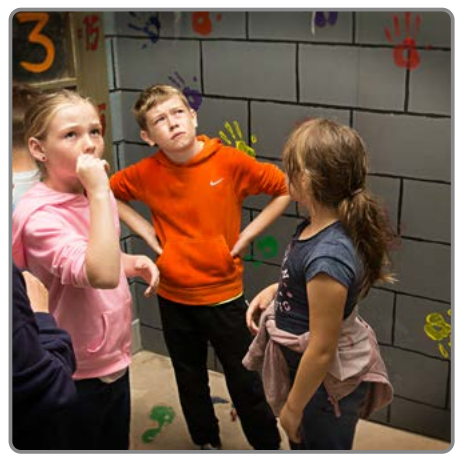
I will also wear a sash like the ones in the photo. They have different names on.