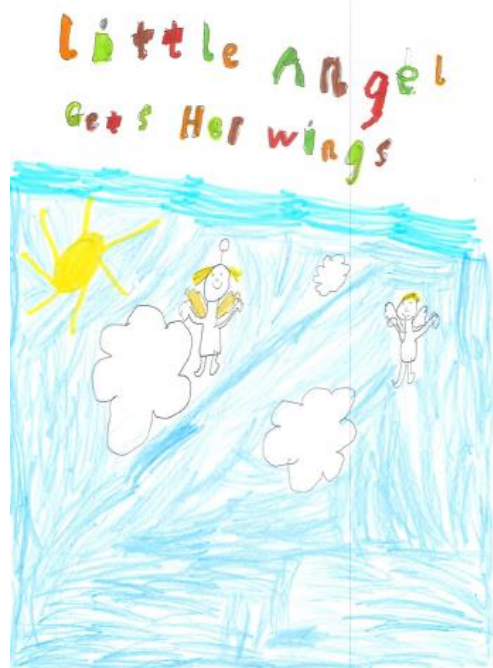
By Elliott, Orange Class

KS1 Have been creating posters for their Christmas show – here are two super examples!