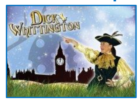
Reception - Year 4 Thursday 15<sup>th</sup> December

On Thursday 15<sup>th</sup> December, we will be taking all of our children from Reception to Year 4 to the Exchange Theatre in North Shields to watch the pantomime Dick Whittington!