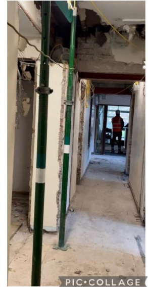
Looking from BEFS staffroom and offices into BEFS hall.