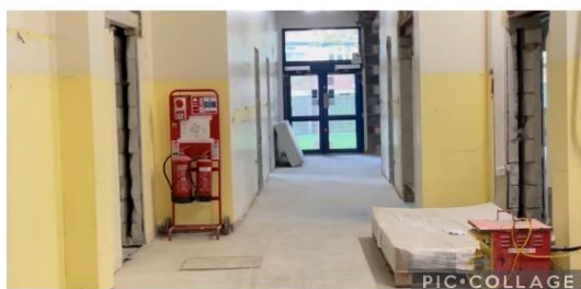
Corridor in BEFS looking towards the old Y4 classroom