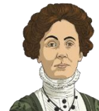
Emmeline Pankhurst 1858-1928