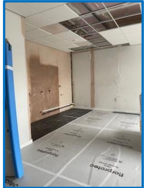
The community room/KS2 practical room – kitchen going in soon!