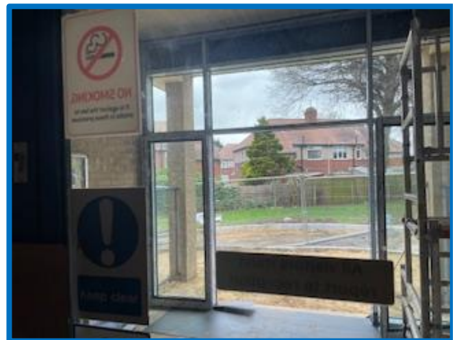
Looking out into the new entrance lobby.