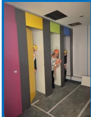
Who can you spot behind the toilet doors!