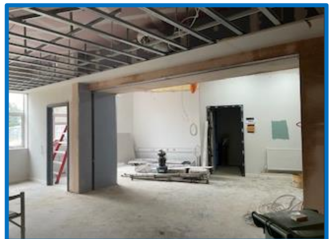
Reception – ready for the new reception desk and window.